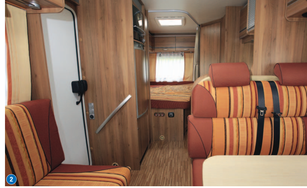
1 The entirely conventional interior sees half-dinette lounge ahead of kitchen 2 Behind the L-shaped galley, a fixed double bed stands next to the washroom

it displays conventionally low-profile charms - its 6.73-metre length is neither surprisingly compact nor ridiculously long. Inside too, there are few surprises as a half-dinette-based lounge heads up an L-shaped kitchen and fixed double bed with washroom alongside in the rear.